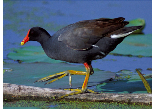
Common moorhen, Jim Rafter

certain number of acres or hectares, but that conservation investments have led to desired outcomes, such as enhancements to bird populations or other natural resources. Thus, the effectiveness of an action at a local scale is often measured by direct or indirect population performance and, therefore, needs to be pooled over regional, flyway, and range-wide scales to truly assess population-level success and to gain a broader context to understand local changes. Documenting outcomes of management and conservation investments improves accountability, leads to more confident decisions, and increases societal acceptance of decisions.