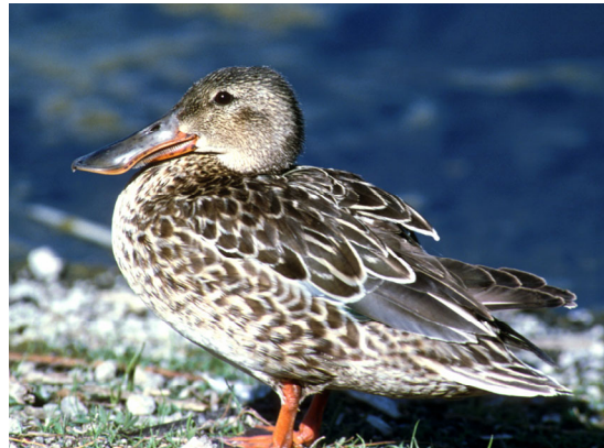
Northern shoveler. Dave Menke

Coordination. Coordination of large-scale survey methods will greatly enhance the value of the information generated by the surveys. Evaluation of replicated management activities among regions requires consistent monitoring designs and implementation. Aggregating information over regions also requires monitoring designs that provide reliable information. Surveys conducted at local scales that do not have appropriate sampling frames or detectability estimation procedures cannot be credibly aggregated to provide regional estimates.