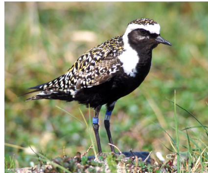
American golden-plover. O.W. Johnson

Bird monitoring is a strategic activity that can be used to assess conservation status, ascertain and predict immediate or cumulative effects of habitat change, establish management and conservation priorities, and determine the effects of management so it can be adapted to meet its objectives. On the other hand, if it is ill-conceived, monitoring can waste funds, equipment, and personnel time. This report describes how current, disparate efforts to monitor avian populations could be improved to enhance efficiency and effectiveness. If recommendations in this report are implemented, our ability to understand and predict the effects of management and natural disturbance on birds would be substantially improved. This will require a commitment to include monitoring as an integral part of management and conservation practices, from project inception to periodic program review. Regular review should be rigorous enough to ensure that monitoring programs address the most critical needs and priorities, are based on consistent and valid methods, and provide secure and accessible data and syntheses.