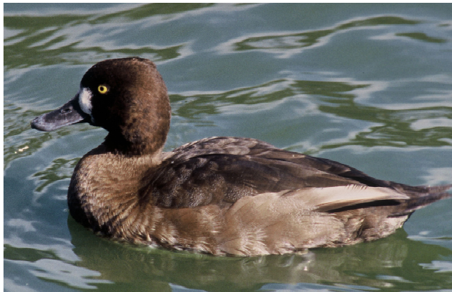
Lesser scaup

We encourage the bird management and conservation community to carefully consider these recommendations. Successful implementation will require a willingness to undertake fundamental changes to the ways in which agencies, initiatives, and other organizations involved in bird conservation are accustomed to operating. We hope that the subsequent work plan developed for the Monitoring Subcommittee will demonstrate the commitment of the U.S. NABCI Committee for improving bird monitoring in the U.S. and, conceivably, beyond U.S. borders.