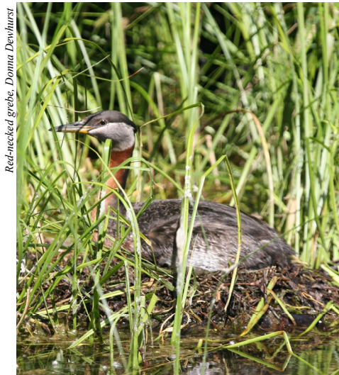
Red-necked grebe, Donna Devilturst

NABCI Action 4.2: Improve coordination and efficiency of data management efforts by providing centralized data repositories that are readily accessible by the monitoring community, analyze “gaps” in current data management systems to identify additional data repositories that need to be developed, and identify resources necessary to develop and maintain these coordinated data management efforts.