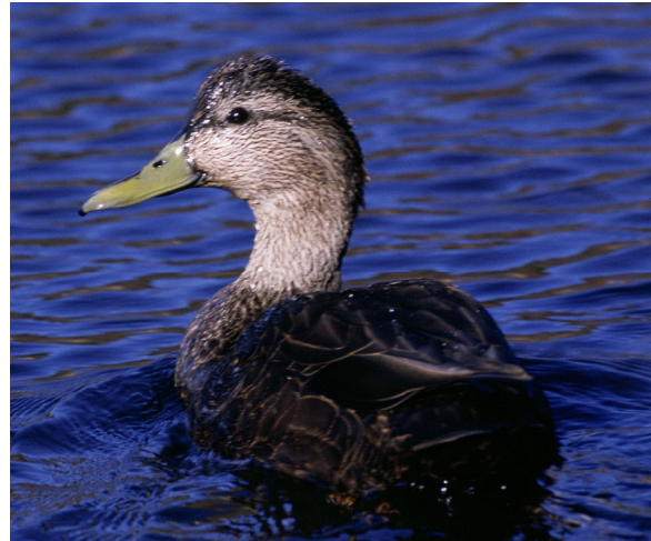
American black duck. Gary Nieminen

As background for discussion, members of the Monitoring Subcommittee drafted summaries from existing documents and polled their respective constituencies to generate a list of monitoring goals and objectives for each participating agency and bird initiative. The Subcommittee also considered general roles that agencies and non-governmental organizations play in bird monitoring (Appendix 1). From the background information presented in Appendix 1, similar objectives were grouped into broad themes that represent shared goals and objectives among U.S. NABCI partners (Appendix 2). Based on these goals and objectives, and on discussions among Monitoring Subcommittee members, four broad goals for improving the current state of bird monitoring in the U.S. were identified. We also conducted a brief overview of current continental and regional bird monitoring efforts, with examples from specific monitoring programs (Appendix 3). Although this is not a comprehensive review of all bird monitoring activities conducted in the U.S., it provides a general context of the type and extent of monitoring that is currently underway, and discusses the strengths and limitations of these efforts.