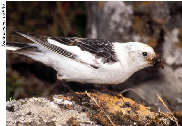
Snow bunting

data in user-friendly formats, and production of timely summaries. Archiving “legacy” data is becoming increasingly important to avoid losing baseline data of value for future comparative studies. Developing accessible permanent archival repositories of monitoring information requires greater attention. Additional issues related to managing bird population monitoring data are discussed in Appendix 5.