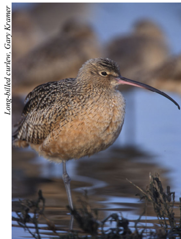
Long-billed curlew. Gary Kramer