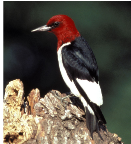
Red-headed woodpecker. Dave Menke

We define “coordination” as the ability to align the various elements of monitoring programs (i.e. design, implementation, analysis, reporting, and evaluation) among stakeholders across appropriate spatial and temporal scales. Effective coordination among stakeholders requires identifying mutual information needs, developing collaborative approaches, leveraging fiscal resources, building information networks to report and share results, and identifying leadership. Although politically and logistically challenging, we argue that almost all local monitoring projects could provide more general and useful information if efforts were coordinated beyond the local scale.