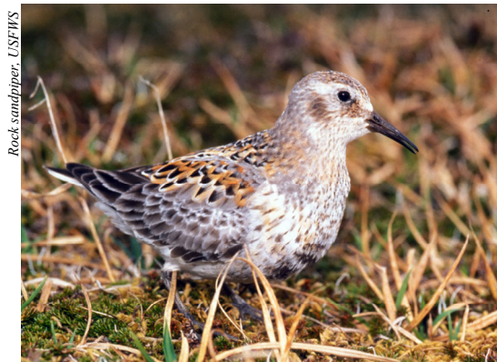
Rock sandpiper

Management, regulatory, and granting program administrators and managers should determine an appropriate and feasible allocation for monitoring and evaluation when budgeting for projects.