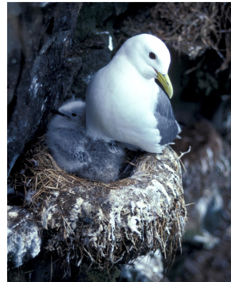
Black-legged Kittiwake, Ternon Bird

We realize that achieving these goals will take staff time and may require additional funding sources. Many improvements, however, can be made by making current programs more efficient, and adopting a practice that acknowledges that a proportion of all management and conservation investment should be allocated toward monitoring and evaluation. This does not mean that every local-scale project needs to spend a portion of their budget on monitoring and evaluation — but that at some appropriate scale, a portion of project resources will need to be spent on understanding the state of the populations we are concerned about, judging how well our actions are meeting management and conservation objectives, and ensuring reliable and timely information is transmitted to decision makers.