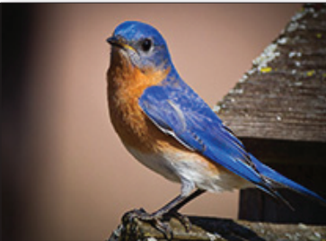
Eastern Blue Bird