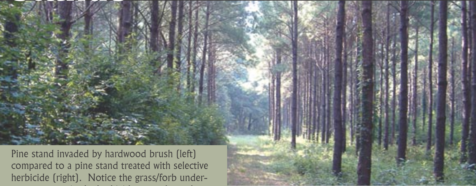
Pine stand invaded by hardwood brush (left) compared to a pine stand treated with selective herbicide (right). Notice the grass/forb understory present in the herbicide treated stand.

Often, fire has been excluded from pine stands for so long that invasive hardwood species can no longer be controlled by low-intensity prescribed fires or disking. After thinning, if hardwood sprouts are abundant in the understory or midstory, it may be necessary to treat these stands with a selective herbicide such as imazapyr (e.g. Arsenal AC®). Chemical control of invasive hardwoods is enhanced when prescribed fire is used during the dormant season following herbicide application (wait at least 6 months after application before burning to maximize herbicide effectiveness). Once these hardwood species are controlled with herbicide, future fire or disking treatments on a 2- to 3-year rotation should provide better control of hardwood invasions. With