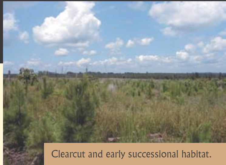
Clearcut and early successional habitat.

Increasingly, herbicides are an important component of site preparation. Selective hardwood herbicides, like imazapyr, can increase pine growth and survival and inhibit development of a dense brush layer, thereby increasing the window of grass/forb plant communities early in the rotation. Use of herbicides for herbaceous control after planting should be restricted to banded applications along the tree rows. When regenerating a harvested stand with loblolly, slash, or longleaf pine seedlings, replant trees on an 8- by 10-foot spacing if quail and other grassland wildlife habitat is your objective. Planting trees on a wider spacing allows maintenance of grassland habitat for a greater period of time before canopy closure of plantations. Rotational disking between planted rows in relatively clean sites can be utilized during the first few years after planting to maintain grassland habitat structure. Always be especially cautious when disking in