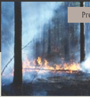
Prescribed fire in pine

Just as thinning stimulates growth of grasses and forbs, it also releases understory hardwood brush and trees that will shade out desirable grasses and forbs if left unmanaged. Some form of periodic disturbance will be necessary to control brush invasion. Prescribed fire and disking are two disturbance tools. When fuel conditions are appropriate for burning, thinned pine stands should be prescribe-burned during winter to early-spring. Prescribed burning should always be conducted by a certified prescribed burn manager, who will develop a written burn plan and obtain appropriate permits before burning. Check with your county Mississippi Forestry Commission office for more information about prescribed burning regulations. If prescribed fire is not an option, light disking between thinned trees during fall or winter is an alternative for relatively clean sites. Always be especially cautious when disking in woodlands to avoid damaging tree trunks and roots and to avoid personal injury or equipment damage. Soil disturbance, such as prescribed fire or disking, enhances habitat quality for quail and other grassland birds because it inhibits woody brush growth, promotes favored seed producing plants, reduces plant residue, increases bare ground, and increases insect abundance. The plant communities that develop following fire or disking also provide highly nutritious forage for deer, rabbits, turkeys, and