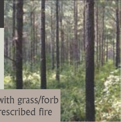
Thinned pine stand with grass/forb understory after prescribed fire

other wildlife. In the absence of soil disturbance, the plant community composition changes over several years, and annual plants are replaced by perennial forbs and grasses and eventually, woody plants. This change in plant communities is called succession. By planning soil disturbances on a 2- to 3-year rotation, you can manage succession and develop a complex of different habitats that meet the seasonal habitat requirements of a number of wildlife species. For example, first-year burn areas typically produce good quail brood cover, whereas second- and third-year burn areas provide better nesting cover. A rotational burning plan can be developed by creating 60-acre or smaller burn units and burning half to a third of these units one year, another half to a third the next year, and so on. Thus, a given unit is only burned every 2-3 years, but some portion of the property is burned each year. A rotational disking plan can be developed similarly. Disk a half to a third of suitable area each year in a rotational fashion so that all suitable areas are disked every 2-3 years.