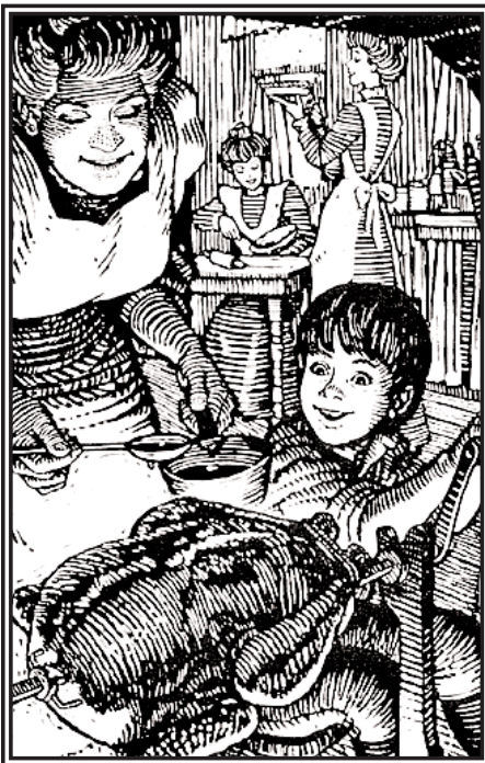
Wild turkey was most likely part of the "fowl" served at the most famous Thanksgiving meal at Plymouth in 1621. However, it did not become a traditional part of the Thanksgiving celebration until about 1800.

When European settlers arrived on the eastern seaboard, wild turkeys apparently lived in what are now 39 continental states and the Canadian province of Ontario. The species is tied closely with the early Native American cultures and has an often-misunderstood association with the history of the United States of America.