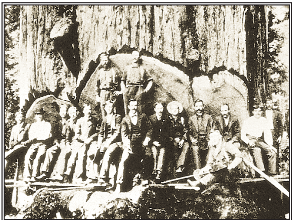
U.S. FOREST SERVICE

It took only 5 years for the Plymouth Colony settlers to see the need for some conservation measures. Vast virgin forests were being steadily cleared, and wild turkeys were among wildlife hunted year-round. These were only 2 of the activities involved in providing necessities for the rapidly growing number of colonists.