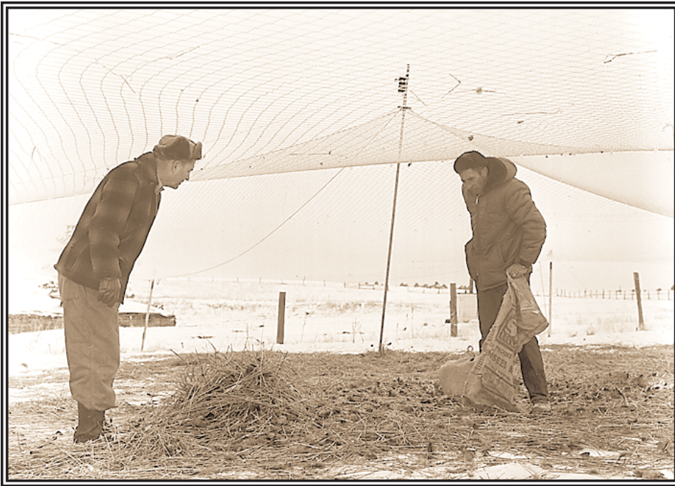
The “drop net” trap method, although used in the southeast in the early 1940s, has been most effective in the prairie states. This scene from South Dakota shows an “old-fashioned” drop net capture around 1960. Trapped birds were individually bundled into burlap bags to quiet them during handling and transportation.

The cannon-net delivery was later speeded up by use of rocket projectiles powered by howitzer powder from the U.S. military. The rockets propelled a nylon-mesh net. In the 1960s, sleep-inducing drugs were also used to capture live birds.