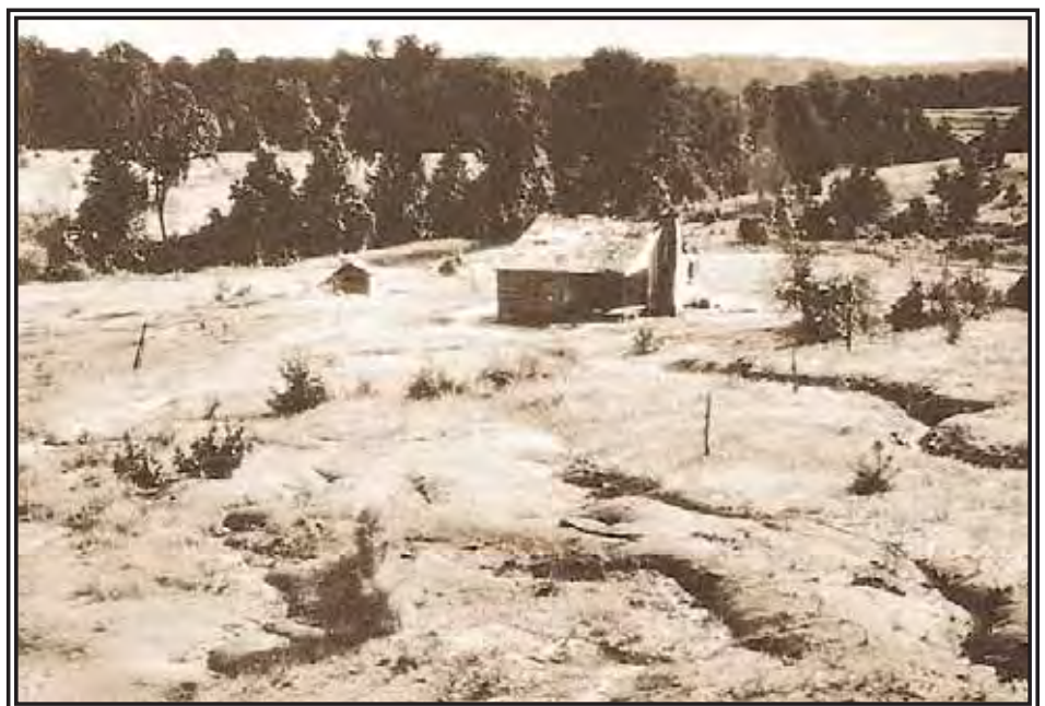
U.S. FOREST SERVICE

As the American population expanded, small farms popped up wherever man could make a living from the land. But once the fields wore out and all the usable timber cut, the farmers moved on leaving the land barren. There were no plans for reforestation.