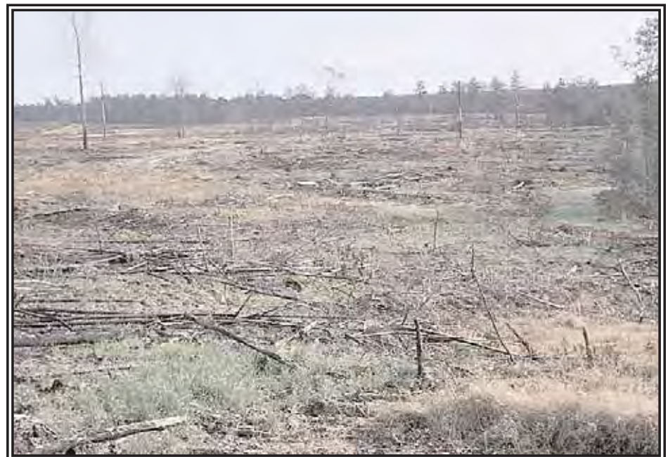
U.S. FOREST SERVICE

The wild turkey has been returned to empty habitats and has been expanded into other suitable areas. It's a marvelous comeback story. However, the primary limiting factor on wild turkey populations continues to be habitat loss like this massive cutover void of suitable wildlife habitat.