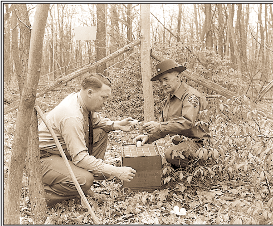
PA GAME COMMISSION

Embracing an idea that seemed logical, many state wildlife agencies attempted to raise turkeys under the control of humans then release them into the wild. These Pennsylvania Game Protectors were collecting turkey eggs from a wild hen's nest to raise and propagate the offspring for use in restoration. The pen-raised method failed and actually slowed the return of the wild turkey by about 2 decades.