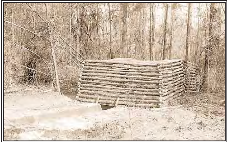
AL. DEPT. OF CONSERVATION & NATURAL RESOURCES

Adopting a trapping method once used by the Native Americans, wildlife biologists constructed pole traps to catch wild turkeys. This primitive method used in the late 1930s and early 1940s lacked the ability to capture birds effectively.