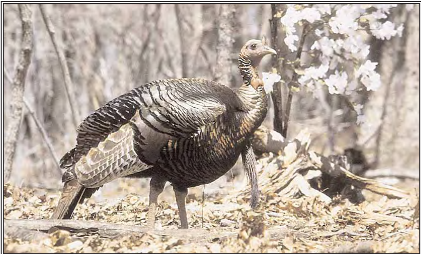
GLENN "TINK" SMITH

The eastern wild turkey is the most abundant of the 5 subspecies found in North America. It inhabits roughly the eastern half of the United States.